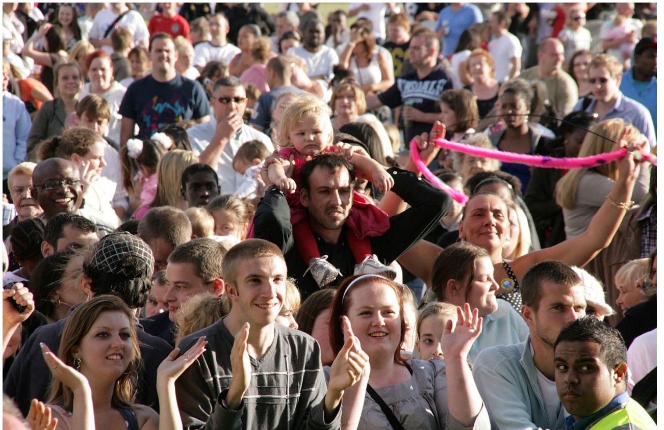
Dagenham Town Show Summer 2010